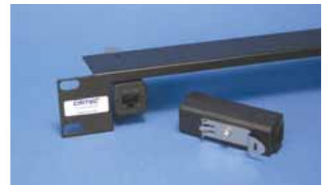
Modular 19" rack application

The CRITEC® line of Local Area Network Protector RJ45 series suits a range of applications from 10BaseT, 100BaseT, 1000BaseT to Power over Ethernet networks. The LANRJ45C6 is designed for up to 1000BaseT Category 6 Ethernet application for the protection of single circuits and can be used individually, is DIN Rail mountable or can be used with the LANRJ45RAK frame for 19" rack mount applications up to 16 units per frame. The LANRJ45POE is designed for up to 100BaseT Category 5 Ethernet application for the protection of single circuits in addition to the application of Power over Ethernet making this product extremely versatile.