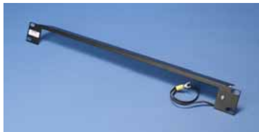
LANRJ45RAK (19" rack mount kit)